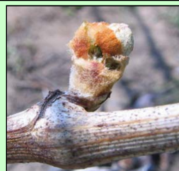
Flea beetle damage at Allegan 1

** New flea beetle damage was low at sites that had damage last week (Allegan 1 and Van Buren ). Damaged buds at these sites are still growing for the most part, but the extent of damage to clusters is not known. New damage was seen at two of the wine grape sites (Allegan 1 and Berrien 3). Wine grapes need to be watched carefully because the buds are still small enough for flea beetles to cause significant damage. Juice grape shoots are almost long enough to be past the danger point. For more flea beetle information click on the title to this section or on the picture to the right.