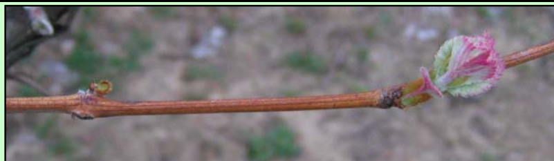
Cutworm-damaged bud (left) and undamaged bud (right)

** No cutworm damage has been seen at any of the seven sites. Damage has been seen elsewhere, though, so keep an eye on buds for feeding damage (see picture to the right). For more cutworm information click on the title to this section or on the picture to the right.