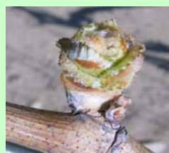
Pinot Noir-Berrien 3